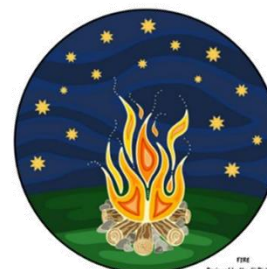
FIRE LESSON PLANS