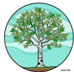
LAND LESSON PLANS